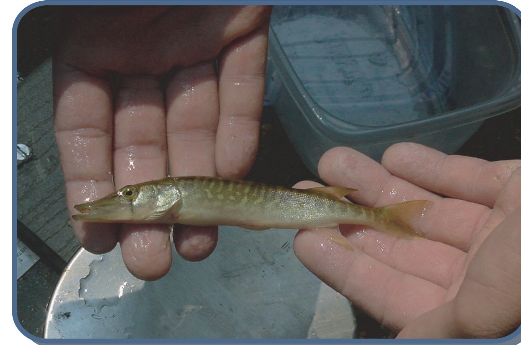
NEPA is assessing the environment

Alternates Retained for Detailed Study (ARDS)