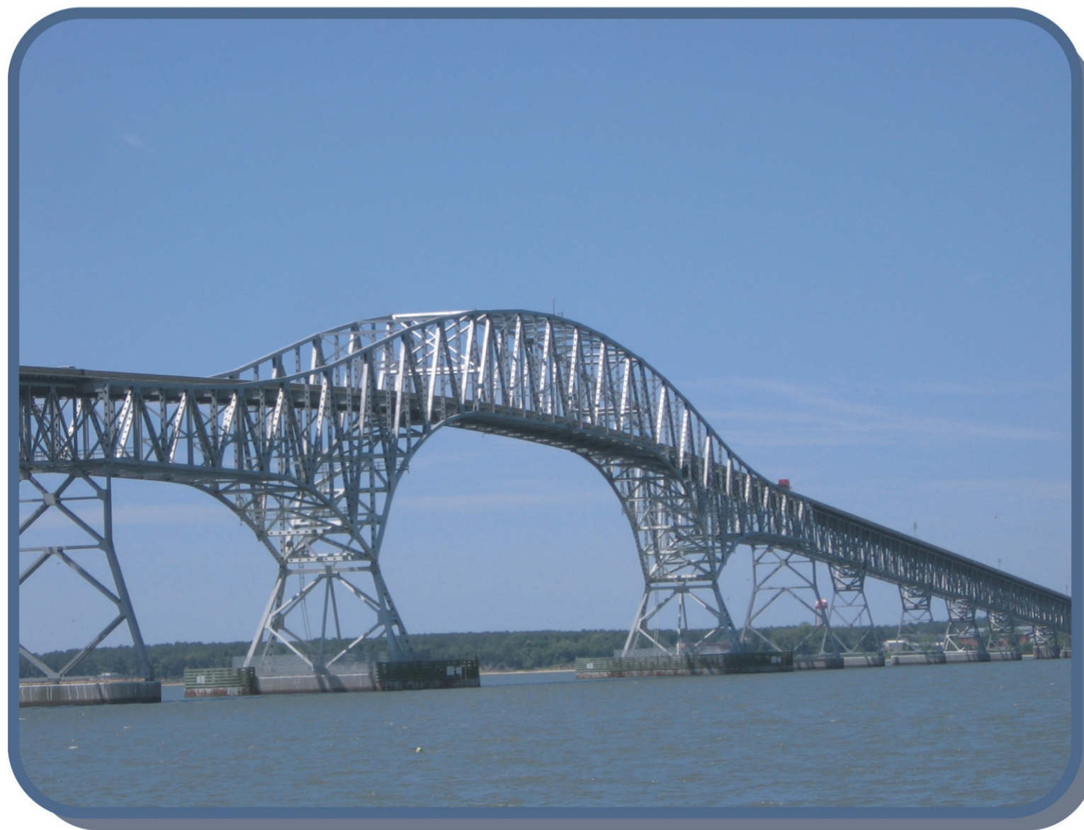
NEPA is evaluating alternates

Circulate Final Environmental Document (FONSI or FEIS) to Public for Review and Comment