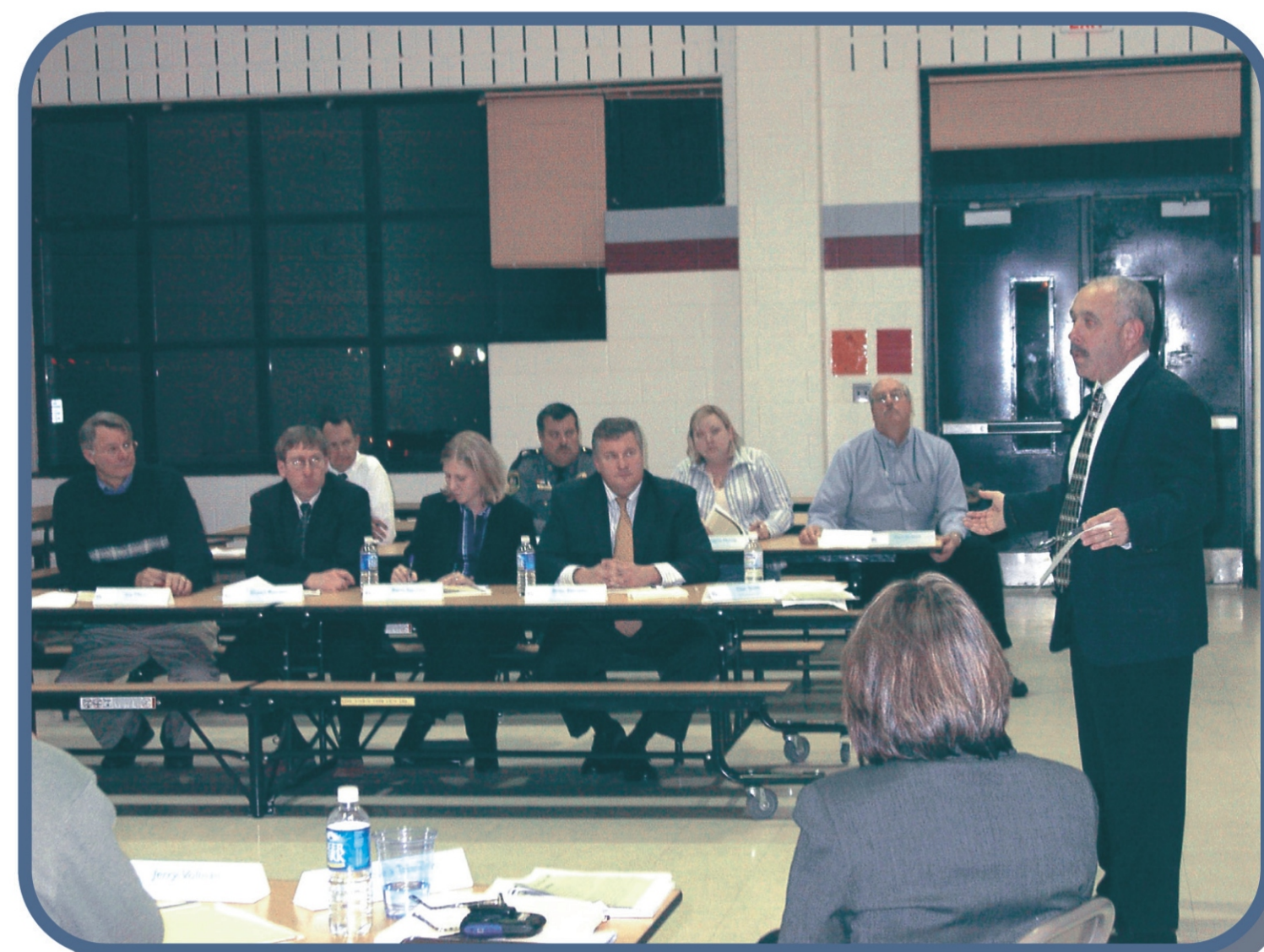
NEPA is meeting with the public